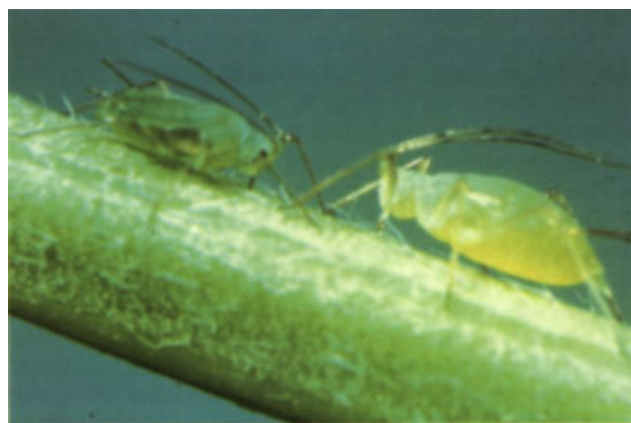
Figure 1. Blue alfalfa aphid (left) and pea aphid (right).

All of these aphid pests feed with piercing-sucking mouthparts and remove fluid from alfalfa plants. When heavy aphid infestations are present, growth of plants is stunted and foliage becomes chlorotic and wilted. Comparing damage by the three species, the pea aphid is least likely to cause mortality of plants, because its feeding does not induce a severe toxic response in alfalfa. The toxic reaction to feeding of the blue aphid causes deformation of leaves near the plant terminals followed by stunting and death of plants when high population densities occur without proper control measures.